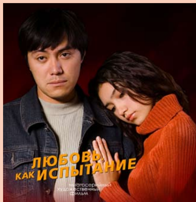
This poster tells people “Love as a Test” is not just about HIV. It is a love story starring one of Kyrgyzstan’s most popular male actors.

From 2001 to 2007, the estimated number of people living with HIV increased from 1,000 to 4,200. HIV prevalence is now 0.1 percent in the general population, but 0.2 percent among young men (15 to 24). UNICEF’s 2006 Multi-Indicator Cluster Survey (MIC) found that only 30 percent of young men and 33 percent of young women knew enough about HIV to correctly identify the main ways of preventing sexual transmission and the most common misconceptions about HIV. One implication is that, while women at present account for only one-quarter of all HIV cases, they may account for increasing proportions as infected males infect their wives and girlfriends.