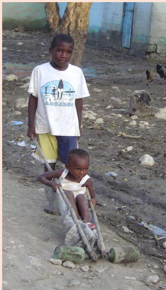
Batey life is not easy, but this boy's little sister looks as if there will be no stopping her from getting to where she wants to go.

Since bateyes have no official status, their exact numbers are unknown but in the 1990s there were an estimated 350 to 400 with 200 to 800 residents each. Many residents have no legal papers to say they are citizens with rights to public education, health and other services. As a result, they often have little or no formal education and, while they may speak enough Spanish to get by, they speak Creole to each other. Their local health clinics are often grossly inadequate, the costs of travel to and services at better clinics and hospitals are often prohibitive, and they often have little knowledge about medicine and turn to sorcerers and healers for cures.