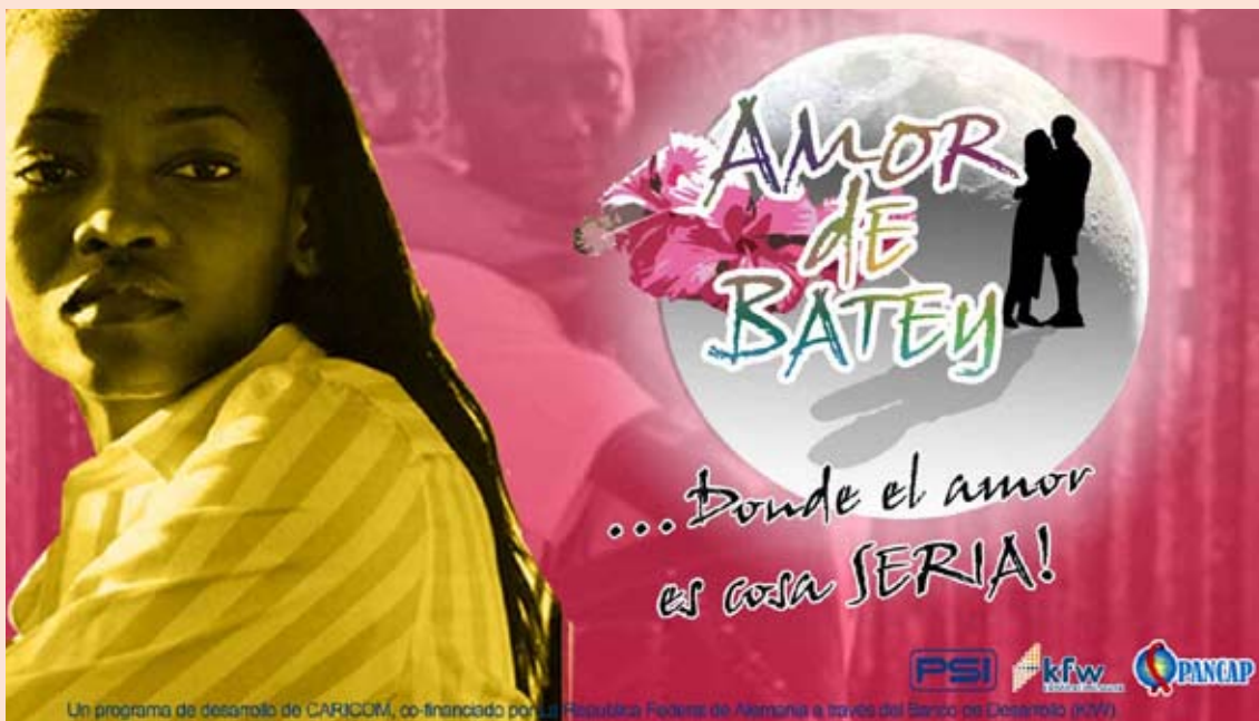
In “Amor de Batey,” Lucy finds new purpose in life and returns to school after joining a support group for people living with HIV.

The original version for television broadcast consists of five 20-minute episodes designed to fit standard half-hour television slots with room for ads for condoms and HIV-related information spots. Those five episodes have been edited and reformatted to create an educational version consisting of 12 chapters on DVD. Each of these chapters focuses on a particular issue or set of issues and is designed for use in classrooms, meetings and training workshops. The BCC guide is designed to go with these chapters and to provide further information and guidance for group discussion.