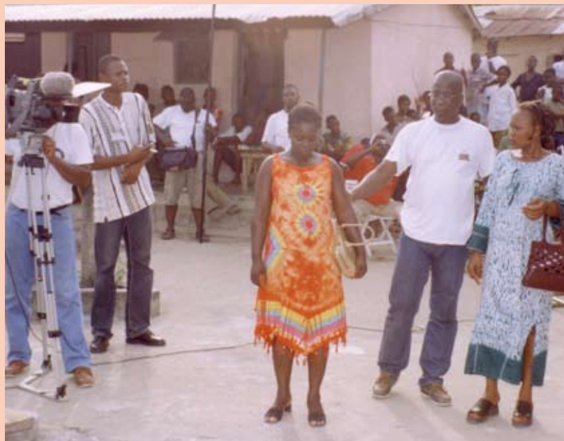
Filming a scene for “SIDA dans la Cité,” the third series.

The second series was first broadcast from October 1996 to February 1997 and proved as popular as the first, not only in Côte d’Ivoire, but throughout francophone West and Central Africa. An evaluation commissioned by PSI (and summarized later in this publication) found that the second series was especially successful at reaching people who engage in high-risk sexual activity and increasing their use of condoms, and the partners in the Côte d’Ivoire Social Marketing Program subsequently agreed to commission a third series of 16 episodes of “SIDA dans la Cité”.