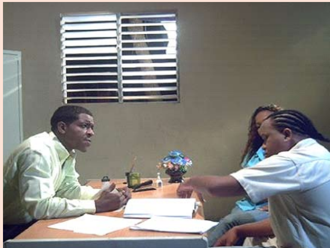
As Lucy and a counsellor listen, Pedro explains how he thinks he acquired HIV but fails to mention that he picks up other women in bars and never wears condoms.

“Amor de Batey” is comparatively new and there has been no formal evaluation of its impacts on the knowledge, attitudes and behaviour of its target audience. However, the Programs Manager with PSI Dominican Republic believes that the broadcast version has played a significant role in the uptake of the millions of condoms being marketed by NGOs under the Bateyes Programme and that the 12-chapter education version is proving to be an even bigger success. NGOs are finding that those chapters and the accompanying BCC guide provide them with the tools they need to conduct successful group counselling sessions and to do education and training in classrooms, meetings and workshops. They work not just for the target audience of Haitians in bateyes and rural areas but for people of all backgrounds and, especially, for people in the poor barrios of Santo Domingo and other cities. In fact, the characters, attitudes, behaviour and situations portrayed in “Amor de Batey” are familiar to anyone who lives in the Dominican Republic and in many other countries in the Caribbean.