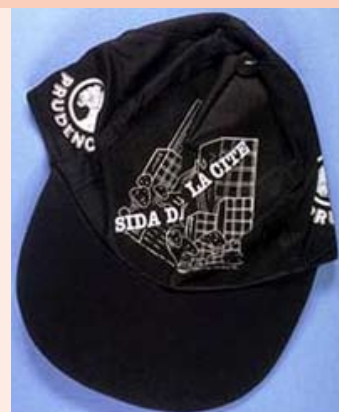
Agence Ivoirienne de Marketing Social (AIMAS) used posters, t-shirts, baseball caps and a theme song by Alpha Blondy to publicize the first broadcast of "SIDA dans la Cité" and advertise Prudence condoms.